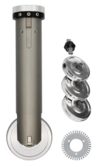
Creasing Wheel Tool